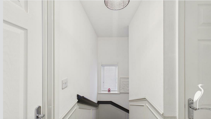
Double glazed window to side elevation, storage cupboard and access point to fully boarded loft space.