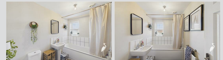
Low level WC, washbasin and bath with dual head waterfall shower over, double glazed window and radiator.

Visit www.peterheron.co.uk or call 0191 510 3323