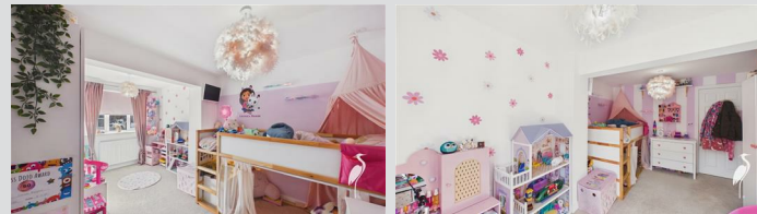
Double glazed window to rear elevation and radiator.