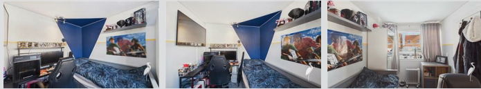
Double glazed window to front elevation.