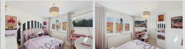
2x double glazed windows to front elevation, radiator and built in wardrobe. Door to en-suite.