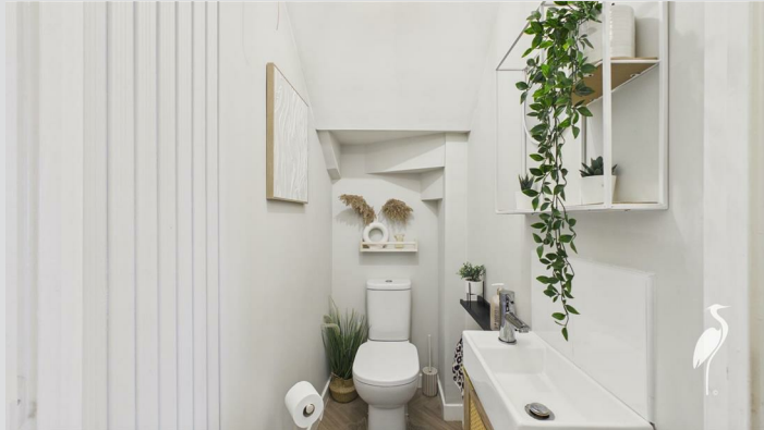
Low level WC and washbasin set into vanity unit, radiator.