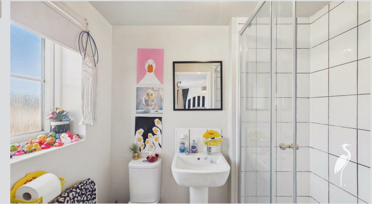
Low level WC, washbasin and shower cubicle, radiator and double glazed window.